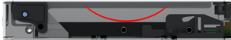
Smart-Fit Anti-Vibration (With 15mm Drive)