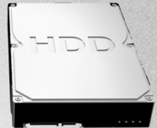
Exact Specifications of Standard 3.5" Hard Drive