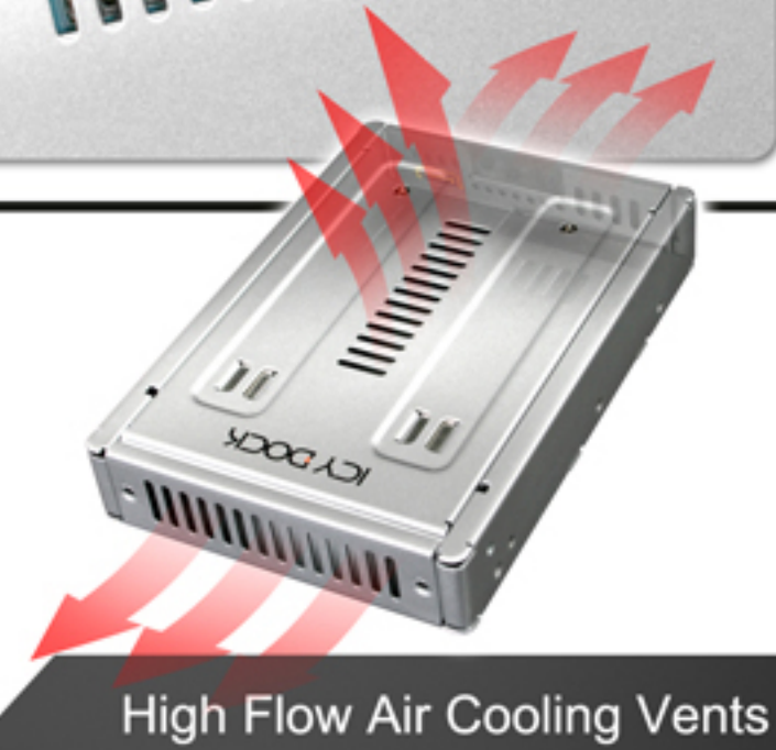
High Flow Air Cooling Vents